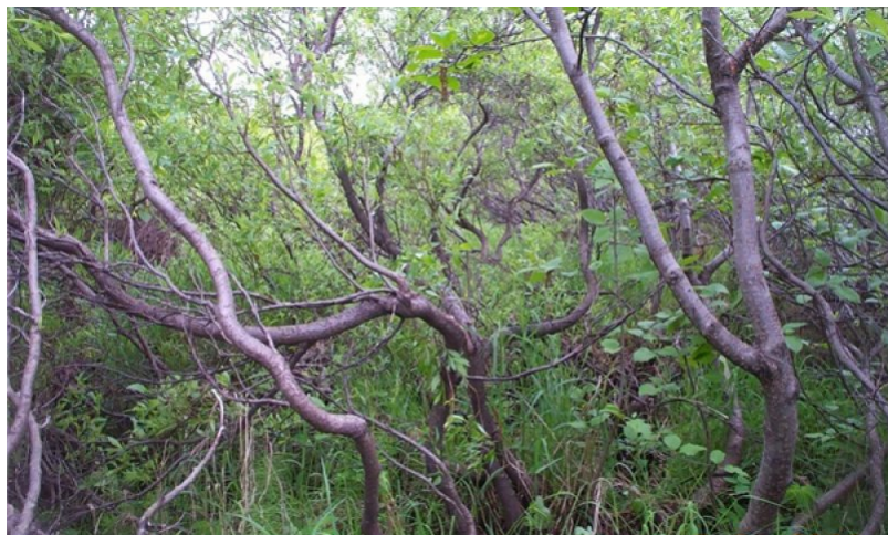
Figure 2. Typical area of community 1.1.