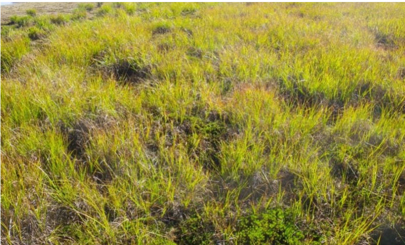
Figure 1. Typical area of community 1.1.

The reference state is the only state in this ecological site. There is only one community described in this state, as there is no known disturbance resulting in a post-disturbance community phase.