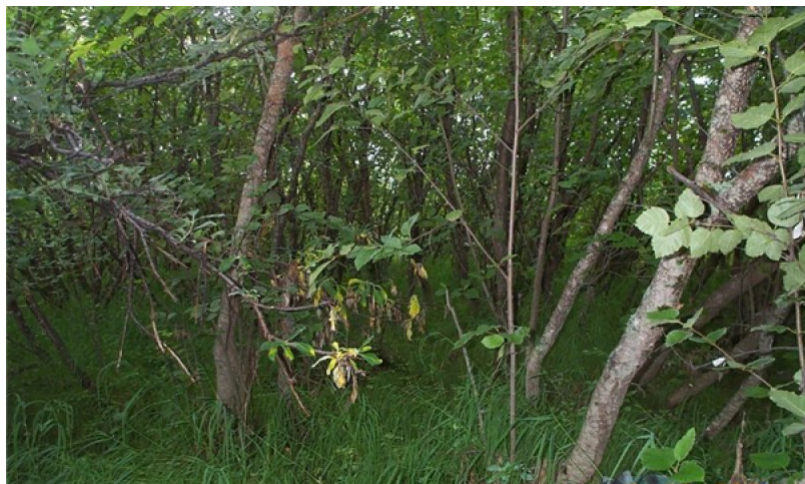
Figure 8. Typical area of community 1.1.