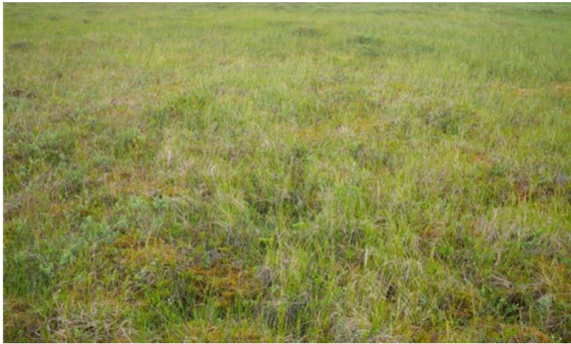
Figure 8. Typical area of community 1.1.