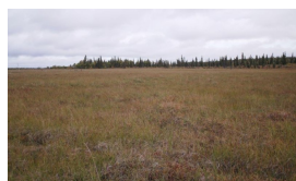
Sedges-cottongrasses/purple marshlocks-water horsetail/sweetgale-dwarf birch/moss open scrubland