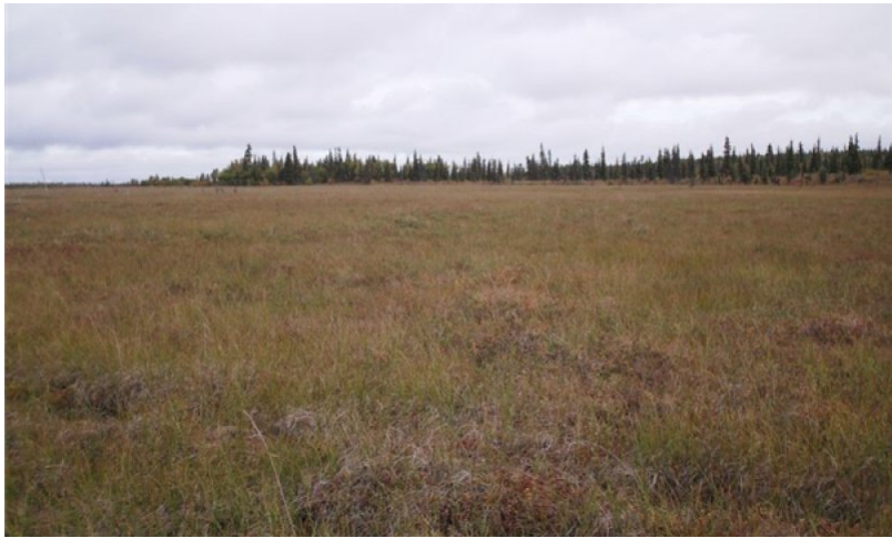
Figure 10. Typical area of community 1.2.