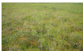
Dwarf birch-sweetgale-marsh Labrador tea/bluejoint grass- sedges/purple marshlocks/moss scrubland

Decreased hydrologic pressure allows less hydrophytic species to colonize and develop sustaining populations. Decreases in precipitation or run-off from surround landforms may be a primary cause. Additionally, the continued build up of the organic layer can lower the associated water table, creating relatively drier soils in the area