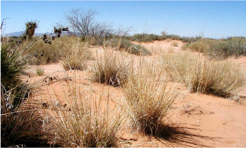
State 3 Shrub-dominated